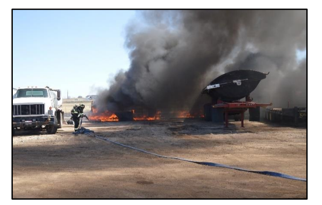
Rural fire involving several vehicles.

In 2023, the District provided automatic or mutual aid on thirty-eight calls that were located outside of the Fort Lupton Fire Protection District and received auto or mutual aid from outside agencies on thirty-two calls. There was one reported residential or commercial structure fire for the City of Fort Lupton. There was a total of three structure fires that resulted in $124,689.00 in fire losses for the Fire District. There were four highway vehicle and six other non-structure/non-vehicle fires with estimated losses of $175,000.00. There were eight brush fires and fourteen other fires. The total fire losses for the fire district in 2023 were estimated at $425,689.00 compared to $665,100.00, in 2022. There were no fire related fatalities or injuries in 2023.