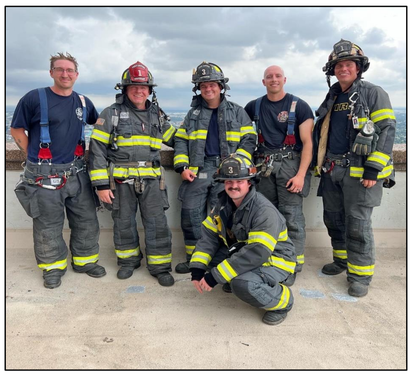
2023 9/11 Stair Climb.

In 2023, eleven firefighters between the ages of 18 and 29 years of age completed a comprehensive physical and cancer screening. In 2024, firefighters who are aged 30 to 39, will complete a comprehensive physical. Annual flu shots, Hepatitis B vaccinations, and workout equipment are a few of the additional health and wellness incentives offered by the fire district.