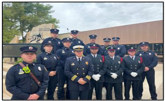
Group picture at the Fort Lupton High School.