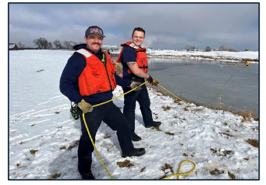
Ice rescue training.