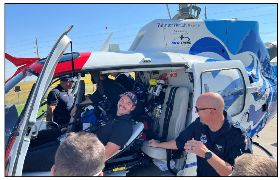
Helicopter safety training.