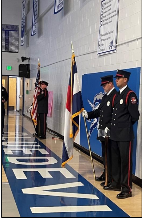
Preparing to post the colors.