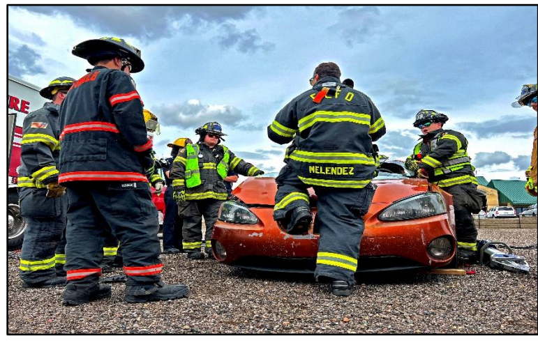
Vehicle extrication training.