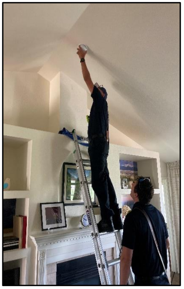
Crews checking a smoke detector.