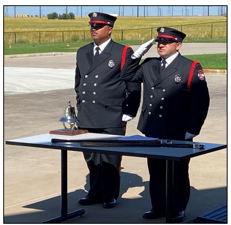
Completion of the Honor Guard Mini Academy.