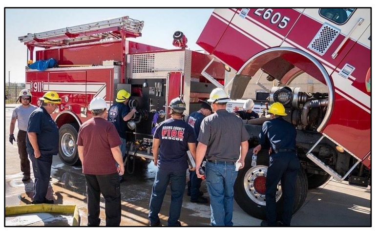
Pump Certification at the Aims Public Safety Institute.