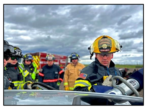
Extrication training during Firefighter II Academy.