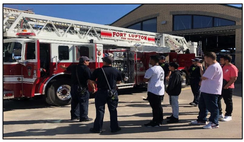
Firefighters give the students from the FLHS Career Explore Program a tour of the truck.

Med Evac Pilot explains the helicopter to students from the FLHS Career Explore Program.