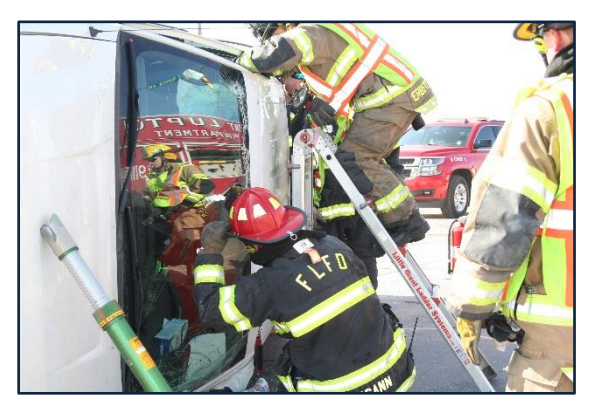
Traffic accident with a party trapped.