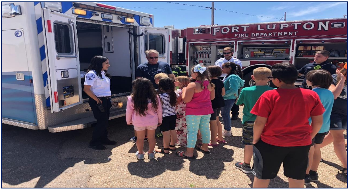
Children get a tour of the ambulance and fire truck during a local safety event.