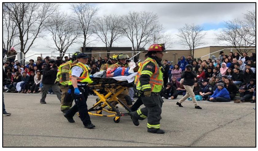
Fire and EMS Crews assist the FLHS with the Every 15 Minutes Program.