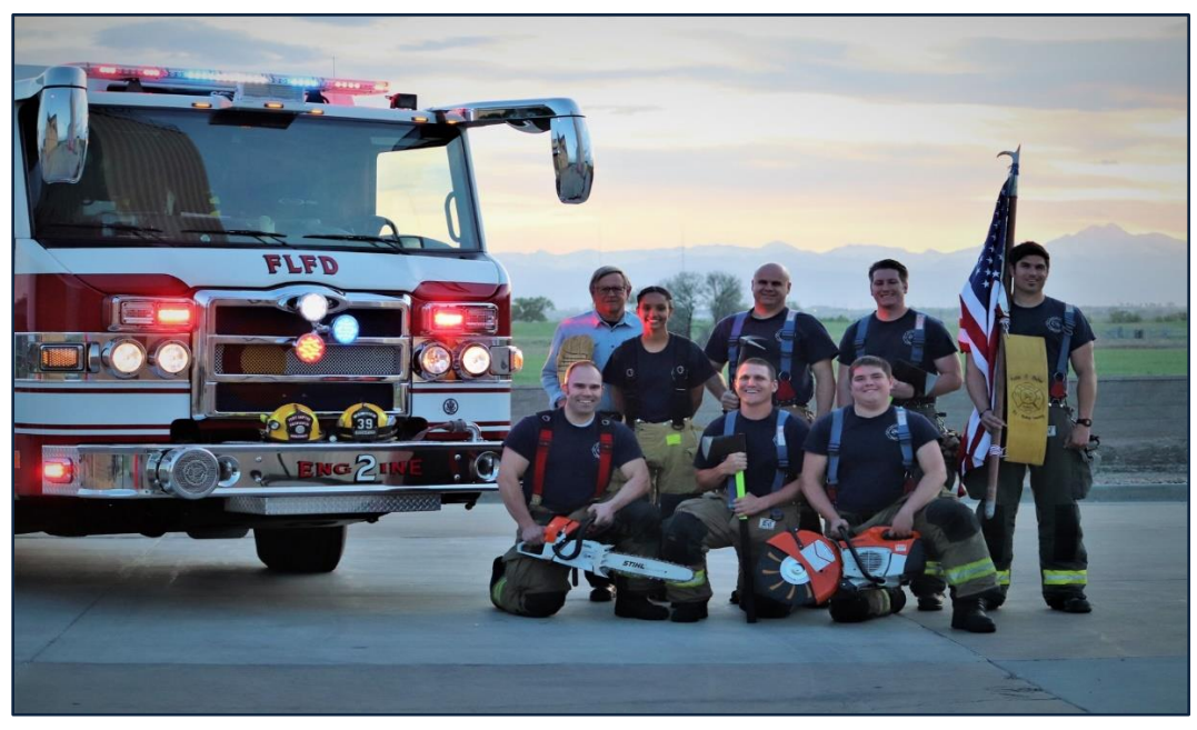
2019 Fire Academy group picture.

Applications for District volunteers are accepted throughout the year. In 2019, the department hired 9 new volunteer members. In 2019, seven volunteer members resigned. Four resigned due to being hired into a career position, one resigned to leave the fire service, one resigned due to a pre employment injury, and one resigned due to move out of state. Two volunteers retired with 10 or more qualified pension years. Five career firefighters resigned in 2019. Four went to larger departments in the Denver metro area and one was promoted to Captain at a different agency. All of those positions were replaced through a hiring process and subsequent hiring list.