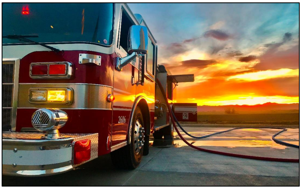
Colorado evening on the training ground.

Web Site: <a href="http://www.fortluptonfire.org/">http://www.fortluptonfire.org/</a>