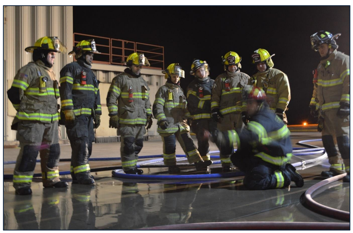
2019 Fire Academy training on hose line advancement.

There were 7,660 training hours completed by both career and volunteer firefighters during 2019. Each firefighter is required to complete a minimum of 36 hours of training annually. Most firefighters will complete well over 100 hours per year. Joint trainings are completed with auto and mutual aid companies from neighboring districts on a quarterly basis. The District supports ongoing fire and medical training to offer growth and development for our existing staff. This includes the Fire Department Instructors Conference (FDIC), attendance at the National Fire Academy (NFA), and other conferences/seminars. We also provide tuition reimbursement for professional development. A majority of the local training classes are provided at the training center and open to outside agencies.