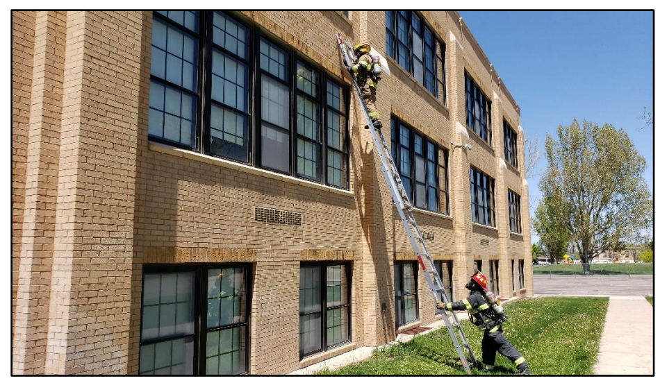
Firefighters complete a strenuous drill in full gear.

In 2019, nine firefighters at the age of 40 and above completed a comprehensive physical and cancer screening. In 2020, firefighters who are between the ages of 18 and 29 years of age will complete a comprehensive physical to assess their health and wellness for firefighting duty fitness. Annual flu shots, Hepatitis B vaccinations, organized sports activities, and workout equipment are a few of the additional health and wellness incentives offered by the fire district. To reduce cancer risks to firefighters, particulate hoods that block out 99% of harmful contamination from smoke were purchased for all personnel and a new policy was implemented that requires on scene decontamination of gear and firefighters with decon wipes after every fire. We also provide decontamination kits for apparatus that were purchased and placed on the trucks. A Health and Wellness committee distributes a quarterly newsletter about healthy lifestyles and wellness.