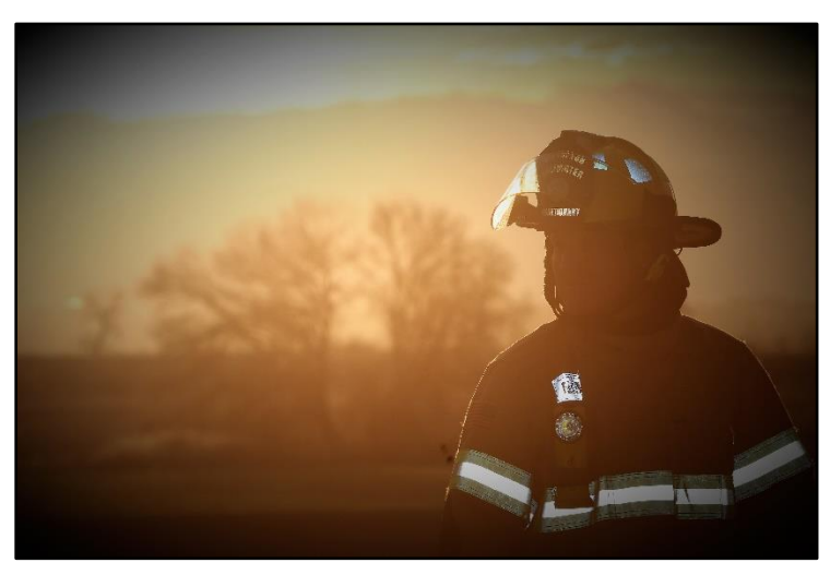
Firefighter training at the Fire Academy.

In 2019, Weld County burn permits remain available online. They are valid for two weeks, for areas outside the city limits of Fort Lupton. The approved items for burning are weeds and small branches (less than 1 inch in diameter). There is no charge for this service. Items that cannot be burned include trash, plastics, furniture, woodpiles, etc.