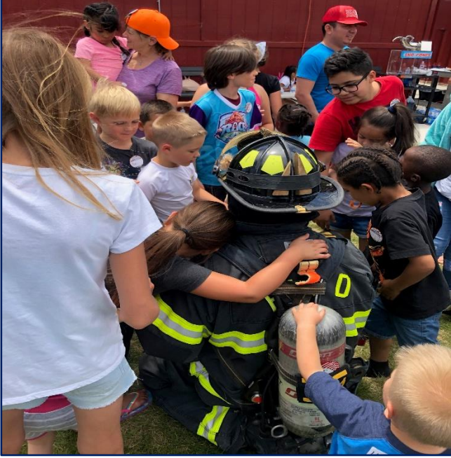
A Firefighter meeting with kids at a local church.

The Fort Lupton Fire Protection District believes that Fire Prevention Programs are an integral part of preventing fire related deaths and injuries in our community. The emotional experience of losing property or lives to fire can be devastating. The District enforces the 2012 International Fire Code. We place a significant responsibility to not only responding to emergencies but also preventing them. Fort Lupton Fire Protection District Fire Marshal Taw Tamlin is responsible for carrying out our fire safety commitment with the community.