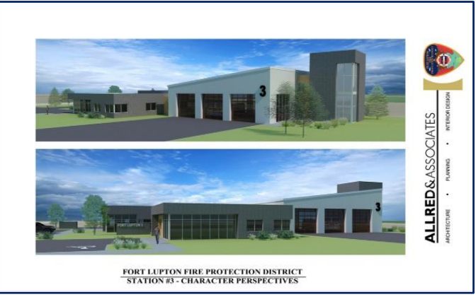
Station 3 design.